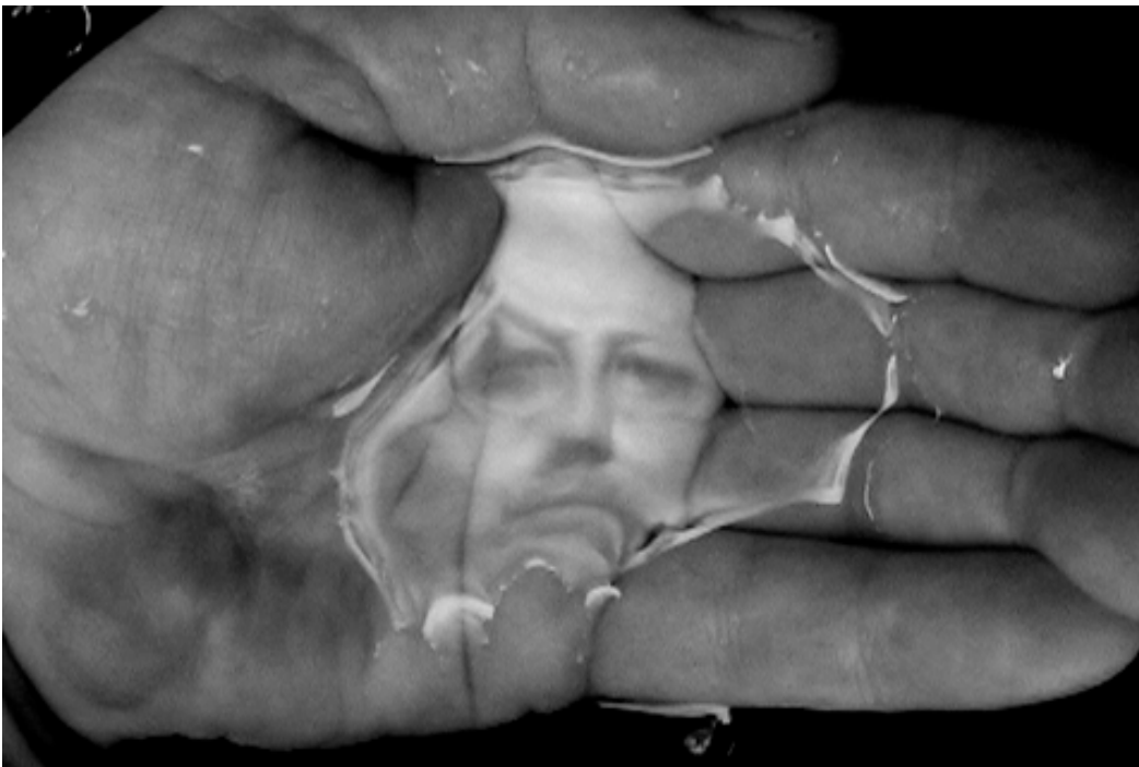
Oscar Muñoz, Línea del destino (Line of destiny). 2006, Single screen projection

The show is also a celebration of the eye that sees and presents photography as a point of view. We all carry with us our own view of the world which we tend to project on everything we see. For the photographer the camera becomes an "extended" eye, a record of the interface between physical and virtual realities. It is not everything we see that we want to "capture"; we make selections based on what we wish to "freeze" as a record or simply in order to share with others. By framing a scene we construct it and what we chose to frame, as well as how we choose to depict this depends on what we actually want to say. In this sense the notion of "reality" becomes elusive, as it is our own reality which we are expressing. It is much like the found object in art, assigning symbolic sense on something through choosing it and subjectively projecting a sense into it. It is the idea that "every picture tells a story," which often challenges our idea of reality and advances the "education of perception," the role of the artist according to McLuhan. In this show we are exploring themes which tell us something about looking and the process of projecting who we are when we look at something. It is the story of the Eye, The Eye Transposed .